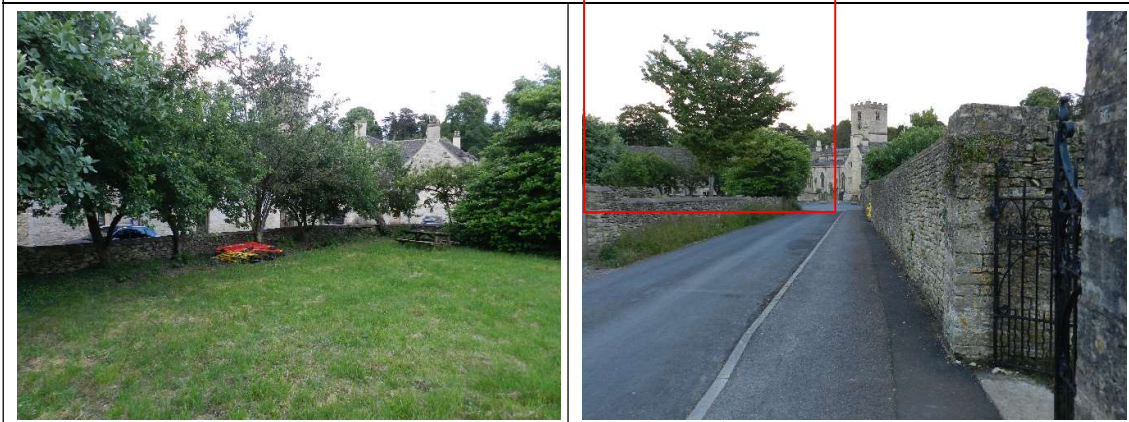
Ornamental tree screen at south-east corner of Upper Kitchen Garden (left) and framing the pivotal view east along Cemetery Lane of St Mary's parish church (Grade I listed) with Church House and Bibury Court beyond