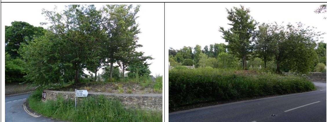
Upper Kitchen Garden with group of 4no. ornamental trees punctuating junction of Cemetery Lane and B4425