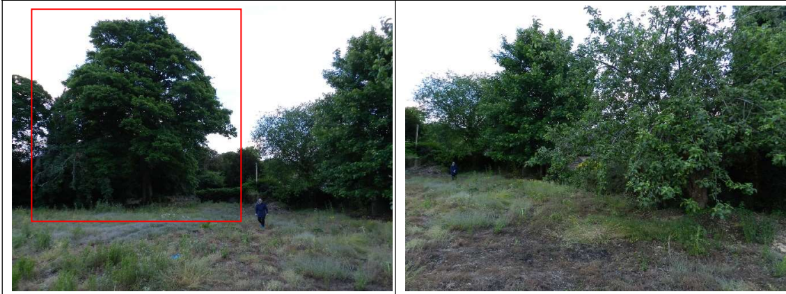
Upper Kitchen Garden view north: 'veteran' Sycamore and Lime trees highlighted, with eastern screen at right