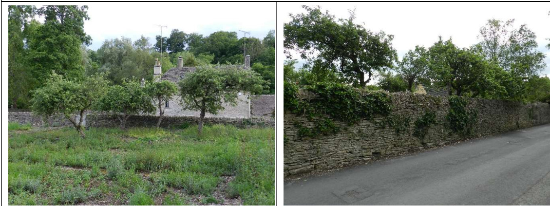
Lower section of Orchard with Osbornes/ Vine Cottage beyond (left) and as viewed from Church Road (right)