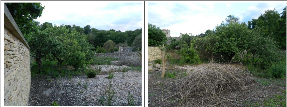
Lower Kitchen Garden viewed from Cemetery Lane entrance (left) and showing Orchard central section (right)